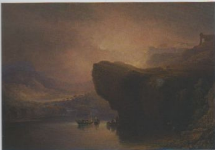
The city of God and the waters of life, by John Martin (1789-1854). Oil on canvas, 46 by 66 cm.