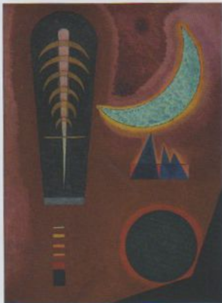
Loses in rot (loosely in red), by Wassily Kandinsky (1866-1944). 1925. Oil on cardboard, 69.2 by 49.5 cm. HAMMER GALLERIES, NEW YORK